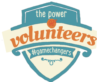
Hours On Each Project